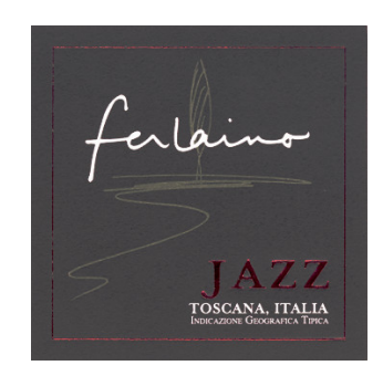
Jazz 2008 Ferlaino (Tuscany, Italy)

Food match: Piquant cheese, Confectionery, Dried fruit tarts