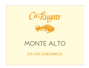
Soave Classico Monte Alto 2009 Ca' Rugate (Veneto, Italy)

Food match: Hard cheese, Confectionery, Dried fruit tarts