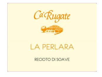
Recioto di Soave La Perlara 2008 Ca' Rugate (Veneto, Italy)

Food match: Roasted meat, Stewed and braised meat, Hard cheese