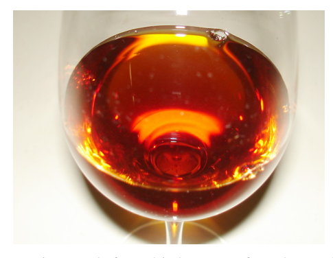
Sweet wines made from dried grapes, after a long aging in bottle, get a deep amber color

The most simple method consists in leaving the bunches on the vine and to wait for the natural drying of berries, therefore the grapes are being harvested. This technique is pretty common, however the most frequent one consists in harvesting ripe grapes - or, in many cases, overripe - and then laying the grapes over mats inside a room and to wait for their drying. Sometimes the drying of grapes is done not in mats but hanging them in wires on racks. The room used for the drying of grapes, when these two methods are being used, must have specific charac-