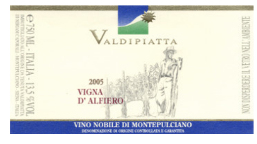
Vino Nobile di Montepulciano Vigna di Alfiero 2005 Tenuta Valdipiatta (Tuscany, Italy)

Food match: Stuffed pasta, Roasted meat, Stewed meat with mush-rooms