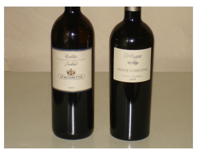
The Collio Friulano and Soave Classico of our comparative tasting

Soave has always been the most famous white wine from Veneto. In past times, together with few other wines, it was considered, in foreign countries, the most representative Italian white wine. Times have then changed as well as the destiny of Soave. This famous white wine from Veneto has followed, like to say, the destiny of Italian wine making, passing from a period in which it was quantity to represent the main presupposition, up to modern changes and trends based on quality. If it is true once Soave was considered as an "ordinary" wine, today it has reached very high quality levels, also thanks to the efforts of producers and the use of quality viticultural and wine making techniques. To this should also be considered the enterprising spirit of many producers who created differ-