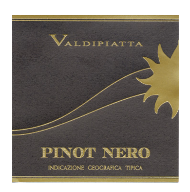
Pinot Nero 2006 Tenuta Valdipiatta (Tuscany, Italy)

Food match: Broiled crustaceans, Mushroom soups, Stuffed pasta