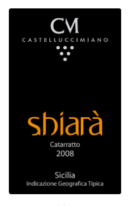
Shiarà 2008 Castellucci Miano (Sicily, Italy)

Food match: Game, Roasted meat, Braised and stewed meat, Hard cheese