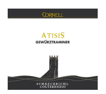
Alto Adige Gewürztraminer Atisis Cornell 2007 Produttori Colterenzio (Alto Adige, Italy)

Food match: Vegetable soups, Broiled crustaceans, Sauteed crustaceans. Risotto with crustaceans