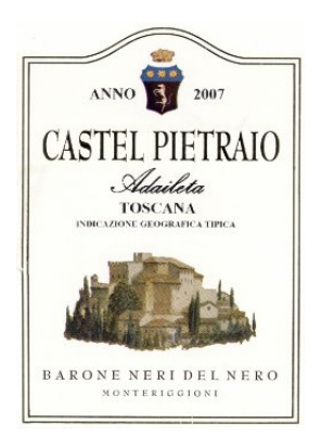
Adaileta 2007 Fattoria di Castel Pietraio (Tuscany, Italy)

Prices are to be considered as indicative. Prices may vary according to the country or the shop where wines are bought