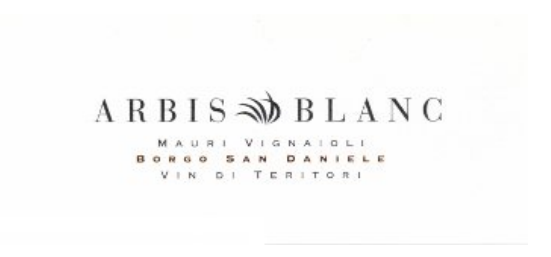
Arbis Blanc 2006 Borgo San Daniele (Friuli Venezia Giulia, Italy)

Food match: Game, Roasted meat, Stewed and braised meat, Hard cheese