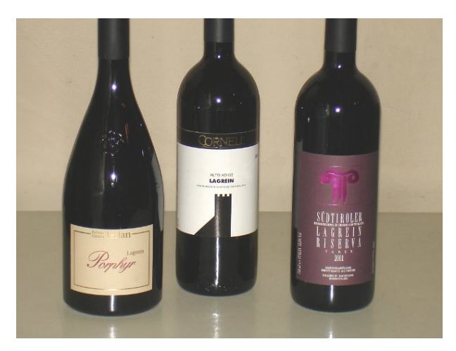
The three Alto Adige Lagrein wines of our comparative tasting

for 12 months. The wines will be chosen according to the latest vintages commercialized by the respective producers and will be server at the temperature of 18°C (65°F). The tasting, as usual, will be done by pouring the wines in three ISO tasting glasses.