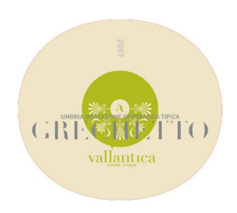
Grechetto 2007 Vallantica (Umbria, Italy)

Food match: Roasted meat, Broiled meat and barbecue, Stewed meat, Hard cheese