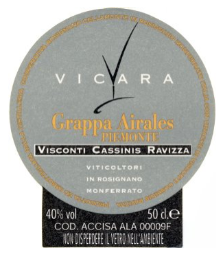
Grappa Airales Vicara (Piedmont, Italy)

Distillates are rated according to DiWineTaste's evaluation method. Please see score legend in the "Wines of the Month" section.