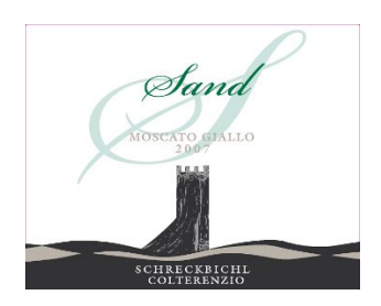
Alto Adige Moscato Giallo Sand 2007 Produttori Colterenzio (Alto Adige, Italy)

Food match: Confectionery, Dried fruit tarts, Piquant cheese