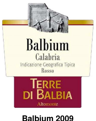
Terre di Balbia (Calabria, Italy)

Food match: Game, Roasted meat, Stewed and braised meat, Hard cheese