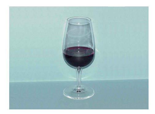
It is in red wines with an evident roundness, in particular the ones made from Merlot and aged in barrique, where the moelleux character is mainly perceived

This can be explained by the relation "expert" tasters have with wine. They do have little satisfaction in recognizing or discovering the sensations perceived from the glass; indeed, they try to analyze the wine while trying to perceive the least evident nuances, less immediate, the ones giving a wine character and personality. It should be said searching for nuances in a wine is getting more and more complex and difficult, also because of the undeniable technological equalization introduced both in vineyard and in wine making. The use of technology and tools available