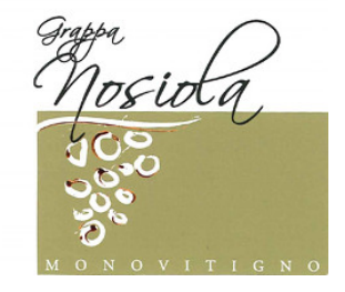
Grappa Nosiola Pisoni (Trentino, Italy)