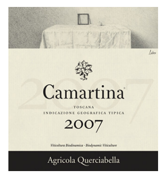
Camartina 2007 Querciabella (Tuscany, Italy)

Food match: Roasted fish, Stuffed pasta with mushrooms, Roasted white meat, Sauteed meat