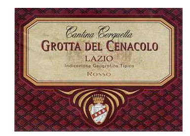
Grotta del Cenacolo 2004 Cantina Cerquetta (Latium, Italy)

Food match: Pasta and risotto with fish and crustaceans, Sauteed white meat, Sauteed fish