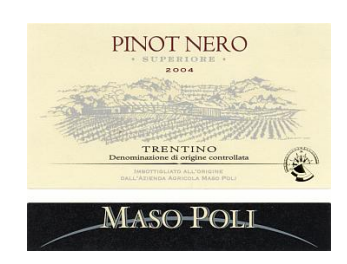
Trentino Superiore Pinot Nero 2004 Maso Poli (Trentino, Italy)

Food match: Dried fruit tarts, Confectionery, Hard cheese