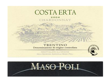
Trentino Chardonnay Costa Erta 2004 Maso Poli (Trentino, Italy)

Food match: Stuffed pasta with mushrooms, Broiled meat and barbecue, Stewed meat