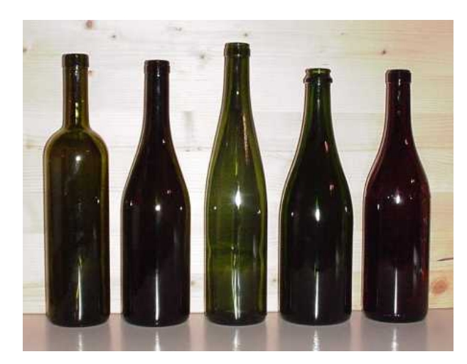
Wine bottles. From left to right: Bordelais, Burgundy, Flute, Champagne, Albeisa

If it is true nothing can be done on the wine after the bottle has been sealed, it is also true we can arrange things in order to make sure the wine will be bottled in its best possible conditions. For this reason it is absolutely important to test the stability and health of wine before proceeding with bottling.