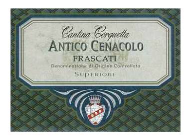
Frascati Superiore Antico Cenacolo 2006 Cantina Cerquetta (Latium, Italy)

Food match: Roasted meat, Stewed and braised meat, Hard cheese