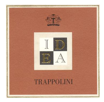
Idea 2006 Trappolini (Latium, Italy)