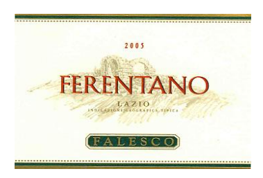
Ferentano 2005 Falesco (Latium, Italy)

Food match: Fish and crustacean appetizers, Pasta and risotto with fish and crustaceans