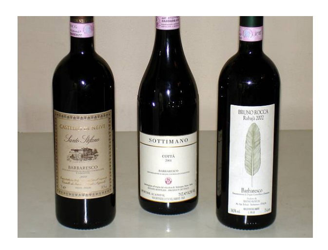
The three Barbaresco wines of our comparative tasting

wines produced with Nebbiolo - including Barbaresco - will be characterized by pretty high transparencies therefore making possible to see an object behind the glass. No matter of this, there are however exceptions in which the transparency of Nebbiolo, and of Barbaresco, is pretty low; a result which can be obtained thanks to specific wine making techniques. As for the color, Barbaresco shows in its youth an intense and brilliant ruby red color, whereas nuances will show evident garnet red hues, sometimes brick red, also during the first years of age. The evolution of the nuances will show in few years an evident brick red color, whereas the color of the wine will take some years in order to show a garnet red color which will in turn become brick red.