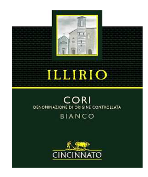
Cori Illirio 2006 Cincinnato (Latium, Italy)

Food match: Vegetable and crustacean appetizers, Pasta and risotto with vegetables, Dairy products