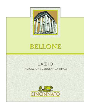
Bellone 2005 Cincinnato (Latium, Italy)