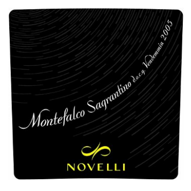
Montefalco Sagrantino 2005 Cantina Novelli (Umbria, Italy)

Food match: Vegetable soups, Pasta and risotto with fish and mushrooms, Stewed fish