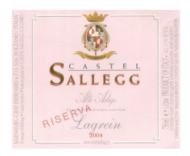
Alto Adige Lagrein Riserva 2004 Castel Sallegg (Alto Adige, Italy)

Food match: Vegetable soups, Broiled crustaceans, Sauteed crustaceans, Risotto with crustaceans