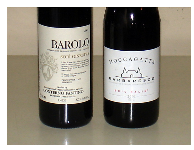
Conterno Fantino's Barolo Sorì Ginestra and Moccagatta's Barbaresco Bric Balin of our comparative tasting

All rights reserved under international copyright conventions. No part of this publication may be reproduced or utilized in any form or by any means, electronic or mechanical, without permission in writing from DiWineTaste. Inquiries should be or mechanical, without permission in writing f sent to Editorial@DiWineTaste.com