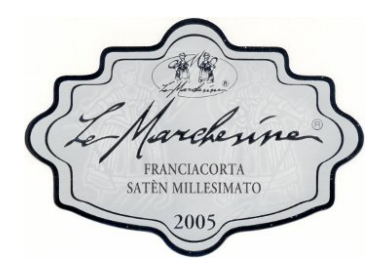
Franciacorta Satèn Millesimato 2005 Le Marchesine (Lombardy, Italy)

Food match: Game, Roasted meat, Braised and stewed meat, Hard cheese