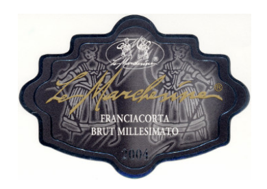
Franciacorta Brut Millesimato 2004 Le Marchesine (Lombardy, Italy)

Food match: Sauteed fish, Pasta and risotto with crustaceans, Broiled crustaceans