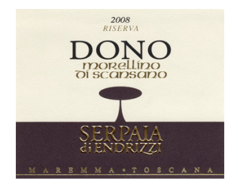
Morellino di Scansano Riserva Dono 2008 Serpaia (Tuscany, Italy)

Food match: Stewed meat with mushrooms, Broiled meat and barbecue, Hard cheese