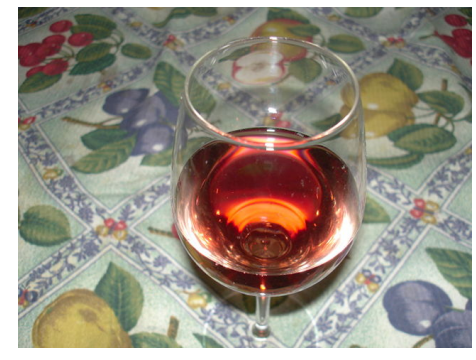
The color in mature rose wines, with time, turn into a pale orange hue

During the maceration it can also start fermentation, a condition helping - as it is commonly known - the extraction of the color from the skins. According to the duration of maceration, rose wines are defined in vin gris (gray wines), roses produced with a maceration of few hours; wines of one night , roses produced with a variable maceration from 8 to 12 hours; wines of one day , roses produced with a maceration from 12 and 24 hours. Rose wines are hardly macerated with the skins for times longer than 24 hours, however it should be noticed that for some rose wine - produced in order to get particular results - the duration can also be of 48 hours. The maceration with the skins does not only give color. As it is usually known, the skin of grapes also contains aromatic and polyphenolic substances, both passed to