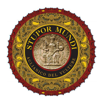
Aglianico del Vulture Stupor Mundi 2007 Carbone Vini (Basilicata, Italy)

Food match: Game, Roasted meat, Braised and stewed meat, Hard cheese