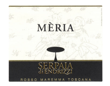
Mèria 2007 Serpaia (Tuscany, Italy)

Food match: Roasted meat, Stewed and braised meat, Broiled meat and barbecue, Hard cheese