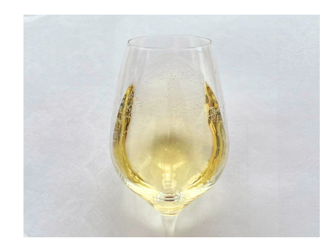
The color of Trento Extra Brut "Blanc de Blancs"

This month's tasting by contrast mainly focuses on the sensorial qualities of classic method sparkling wines exclusively produced with white and red grapes. In particular, we will pour into our glasses a classic method sparkling wine exclusively produced