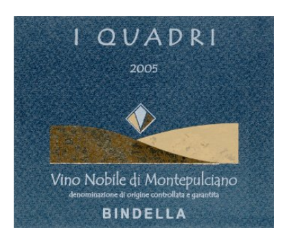
Vino Nobile di Montepulciano I Quadri 2005 Bindella (Tuscany, Italy)

Food match: Roasted meat, Stewed and braised meat with mushrooms, Hard cheese