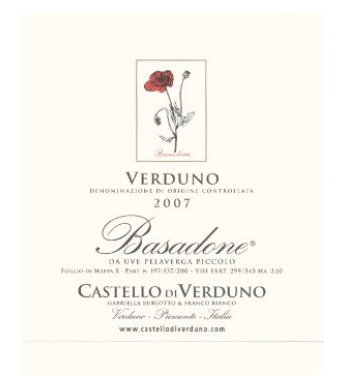
Verduno Pelaverga Basadone 2007 Castello di Verduno (Piedmont, Italy)

Food match: Game, Roasted meat, Stewed and braised meat, Hard cheese