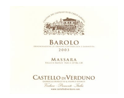
Barolo Massara 2003 Castello di Verduno (Piedmont, Italy)

Food match: Pasta with mushrooms, Sauteed meat with mushrooms