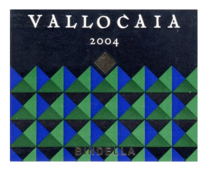
Vallocaia 2004 Bindella (Tuscany, Italy)

Food match: Game, Roasted meat, Braised and stewed meat, Hard cheese