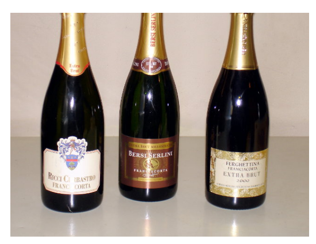
The three Franciacorta Extra Bruts of our comparative tasting

particularity of Franciacorta method - as opposed to other classic method wines - are the long times in bottle on lees, a period which must be of at least 18 months, 24 months for Satèn style, 30 months for vintages and 60 months for reserve wines.