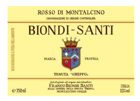
Rosso di Montalcino Etichetta Bianca 2006 Biondi Santi (Tuscany, Italy)

Food match: Game, Roasted meat, Stewed and braised meat, Hard cheese