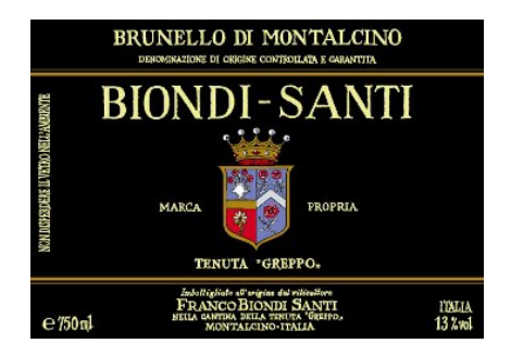
Brunello di Montalcino 2003 Biondi Santi (Tuscany, Italy)

Food match: Broiled meat and barbecue, Roasted meat, Stewed and braised meat with mushrooms