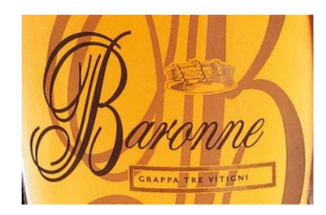
Grappa Stravecchia 20 Anni Baronne Casa Luparia (Piedmont, Italy)

pungency which tends to dissolve rapidly, good correspondence to the nose, pleasing roundness, balanced sweetness. The finish is persistent with flavors of plum, chocolate and honey. This grappa is distilled with a steam operated alembic still and ages for more than one year in cask. Alcohol 45%.