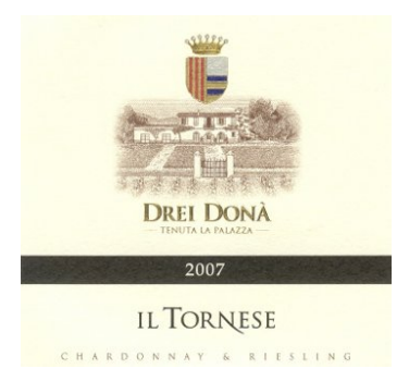
Il Tornese 2007 Drei Donà (Emilia Romagna, Italy)

Food match: Game, Roasted meat, Braised and stewed meat, Hard cheese