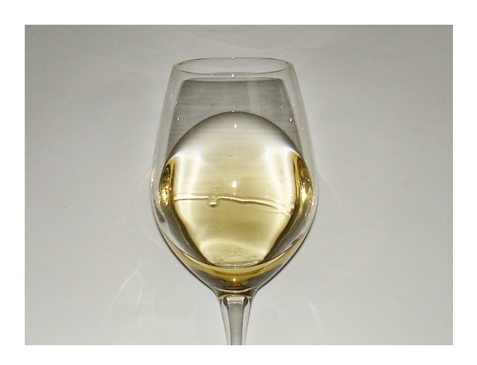
The color of Muscat of Alexandria

If it is true differences in appearance between the two wines are evident, they become even distant in their respective olfactory profiles. In particular, the fact they belong to two different categories of grapes, it is a factor that more than others will determine the sensorial difference between Arneis and Muscat of Alexandria. The Sicilian variety, in fact, belongs to the category of the so-called aromatic varieties, that is grapes capable of making wines characterized by the intense aroma of