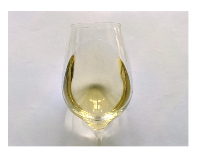
The Color of Est! Est!! Est!!! di Montefiascone

Let's resume the tasting by contrast of this month and proceed