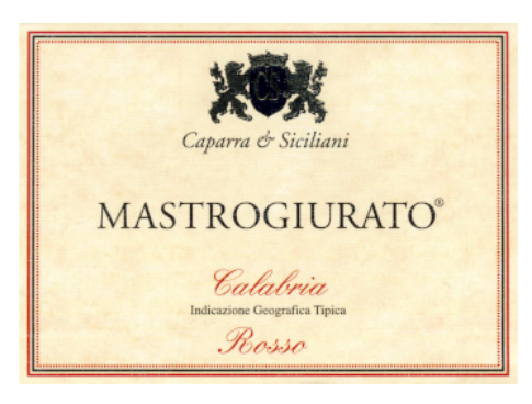
Mastrogiurato 2016 Caparra & Siciliani (Calabria, Italy)

Roasted meat, Stewed meat with mushrooms, Broiled meat and barbecue