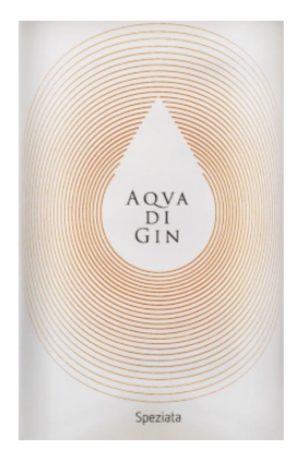
Aqva di Gin Speziata Bespoke Distillery (Campania)

Review of Grappa, Distillates and Brandy