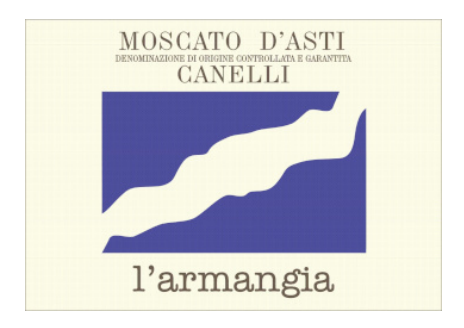
Moscato d'Asti Canelli 2020 L'Armangia (Piedmont, Italy)