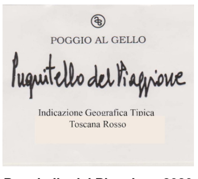
Pugnitello del Piaggione 2020 Poggio al Gello (Tuscany, Italy)

Game, Stewed and braised meat with mushrooms, Roasted meat, Hard cheese