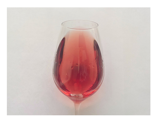
The color of Cerasuolo d'Abruzzo Superiore

Let's proceed with getting the two bottles we will pour into the glasses for our tasting by contrast. At this time, it is about two wines which are very common, therefore it will not be difficult to find them in any good wine shop. For both wines, we need to be careful in choosing bottles which have been produced with the respective varietals alone. This aspect is very important as the production disciplinary of Cannonau di Sardegna Rosato and Cerasuolo d'Abruzzo Superiore allow the use of at least 85% of the primary variety. As far as wine making practices are concerned, we will make sure the two wines have been fermented and aged in inert containers, preferably steel tanks. This allows, in fact, to better appreciate the qualities of the two grapes and, in particular, the crispness of the rosés. The two wines belong to the most recent vintage and are poured into their respective glasses at a temperature of 12 °C. (54 °F)