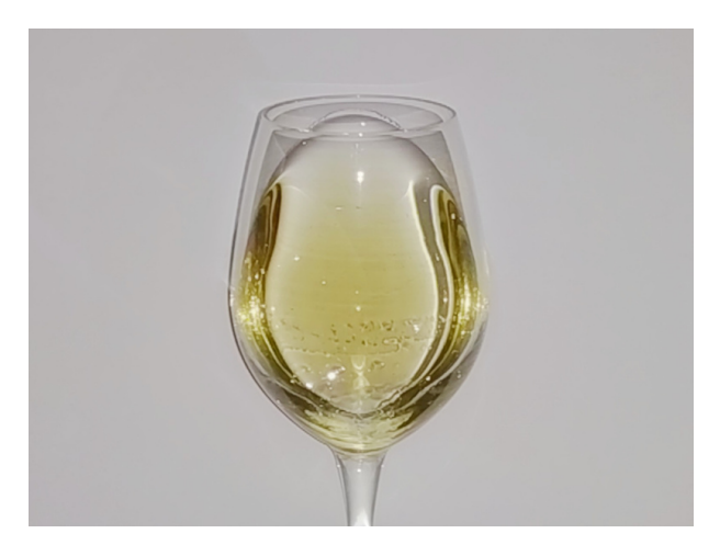
The color of Orvieto Classico Supereiore

Let's choose the two wines for the tasting by contrast of this month, a choice that – undoubtedly – is not so difficult as the two wines - Orvieto Classico Superiore and Verdicchio di Matelica – can be easily found in any wine shop. However, we will pay attention to the composition of the wines, the vintage and the container used for aging. As for Orvieto Classico Superiore, this wine is being produced with the union of many grapes and, besides the two main varieties – Procanico, that is Trebbiano Toscano, and Grechetto – we will make sure Malvasia Bianca, Canaiolo Bianco and Verdello are also found in the composition. We will therefore choose an Orvieto Classico in the very meaning of it, that is, produced with the grapes that traditionally and typically are used for its making. The choice of Verdicchio di Matelica is generally simple as, in most of the cases, we find in its composition this grape only, however it is good to notice its production disciplinary provides for a minimum of 85% of