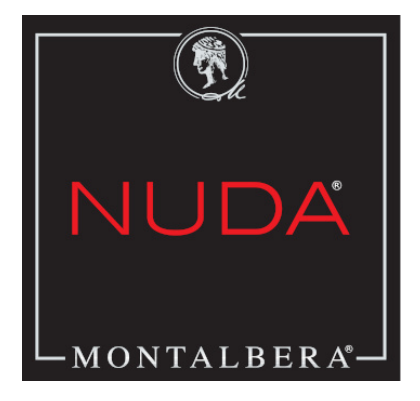
Barbera d'Asti Superiore Nuda 2016 Montalbera (Piedmont, Italy)

Broiled meat and barbecue, Roasted meat, Stewed meat with mush-rooms, Hard cheese