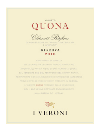
Chianti Rufina Riserva Quona 2016 I Veroni (Tuscany, Italy)