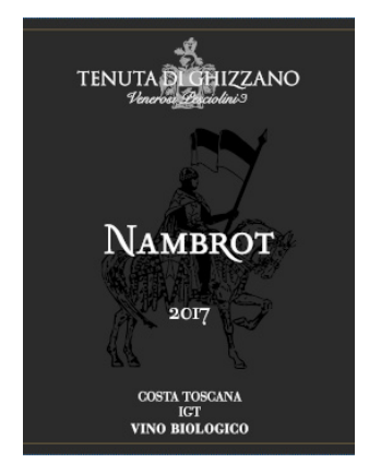
Nambrot 2017 Tenuta di Ghizzano (Tuscany, Italy)

Merlot (60%), Cabernet Franc (20%), Petit Verdot (20%)