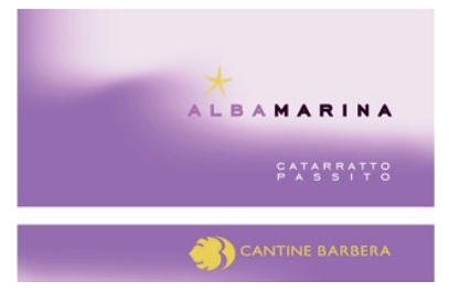
Albamarina 2011 Cantine Barbera (Sicily, Italy)

Food match: Stewed and braised meat, Roasted meat, Hard cheese