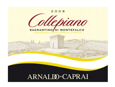
Sagrantino di Montefalco Collepiano 2008 Arnaldo Caprai (Umbria, Italy)

Food match: Chocolate, Chocolate tarts, Hard cheese, Jam tarts