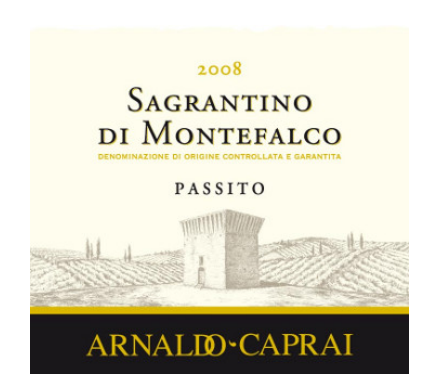
Sagrantino di Montefalco Passito 2008 Arnaldo Caprai (Umbria, Italy)

Food match: Fruit and cream tarts, Hard cheese