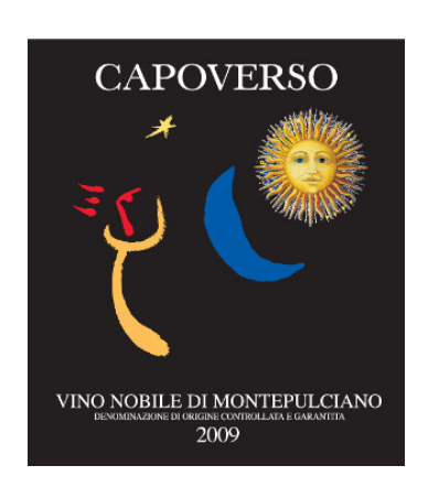
Vino Nobile di Montepulciano 2009 Capoverso (Tuscany, Italy)

Food match: Stuffed pasta, Roasted meat, Stewed meat