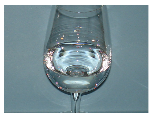
Clear and limpid: alcohol in its pure form shows as a transparent and crystalline liquid

The fermentation process therefore ends - provided favorable environmental conditions - both because of the total consumption of sugar, as well as for the high quantity of alcohol that in certain cases is produced by yeast. Without sugar, yeast have no possibility of survival and of nourishment, a condition which unavoidably brings to the end of the biological activity, leaving to the liquid a certain quantity of ethyl alcohol. It should be said the process of fermentation also produces other substances, although in lower quantity than ethyl alcohol, among the many, the "famous" and widely debated sulfur dioxide. At the end of fermentation - technically called alcoholic or primary - yeast will give back grape juice transformed into wine, a complex beverage and characterized by countless