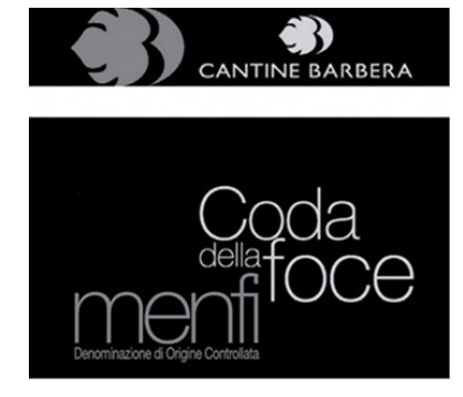
Menfi Rosso Riserva Coda della Foce 2008 Cantine Barbera (Sicily, Italy)

Food match: Game, Roasted meat, Stewed and braised meat, Hard cheese